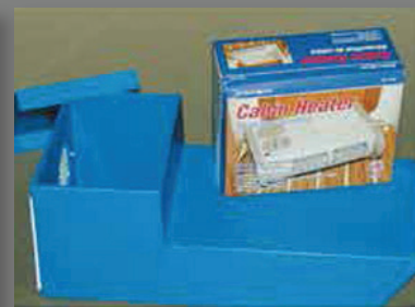
Deluxe, high-performance heater is enclosed in a moisture-resistance box