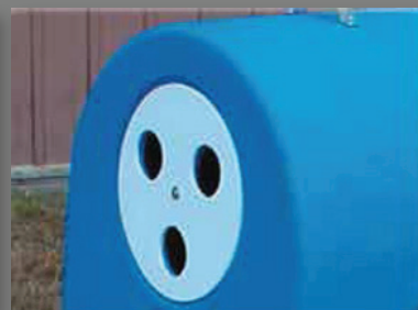
Vent/Peep hole for proper ventilation and viewing